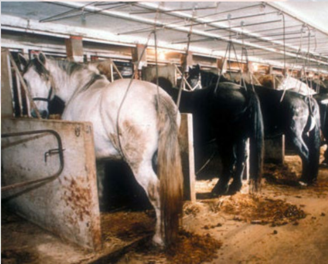
A Premarin horse farm. Horses' back legs are restrained to capture urine, which prevents all movement.

The urine of pregnant mares is used to make estrogen substitutes. “Premarin Mares” are repeatedly impregnated and spend up to 12 years in stalls too small to turn around in. They must stand without turning 24/7 for 6 of the 11 months they’re pregnant, although horses sleep lying down. They’re denied adequate water (to concentrate urine) and wear a rubber urine-bag at all times, which causes burns and lesions. They cannot run or socialize. And their babies? Females join the workforce. Males and tired mares are auctioned off. Can you guess who buys them in large numbers?