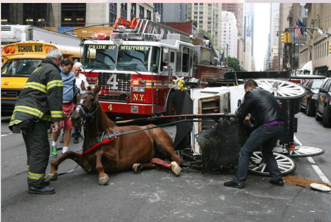
Injured carriage horses are often euthanized.

work long, 9-hour days, pounding asphalt pavement on feet designed to walk on soft surfaces. For 9 hours, they breathe in toxic fumes from buses, cars, and trucks. Horses are naturally skittish, and cities are noisy and crowded. Sudden noises and sights—ambulances, horns, bikers whizzing by—can terrify horses. Drivers don't always pay attention. In fact, in 2020, a 10-year-old horse named Aisha was filmed as she stumblingly collapsed onto the ground in Central Park, too weak to stand. She was euthanized later that week. She isn't the only one: another incident on film saw a horse collapse after running into a parked car, which later backed on to her where she lay.