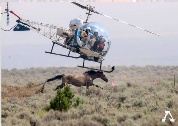
For this horse, this helicopter is the end of a free life. Slaughter is inescapable.

Horses bond as closely as we do with our families. Imagine: a herd wakes in their familiar home and goes about business as usual when they're ambushed. Mothers struggle to keep their children together amid the confusion while trying to evade this terrifying machine. Some are so eager to get away from the helicopter that they don't notice the barbed wire fences around the trap areas, and run right into them, falling over, breaking bones, cutting up their faces on the razor-sharp wire. Formerly wild horses will now be held in trap pens until a buyer comes to take them. Scared, many stallions will fight viciously in the enclosed space. Survivors are transported in crowded, inhumane conditions over thousands of miles. Just a few minutes earlier, they had all been grazing peacefully.