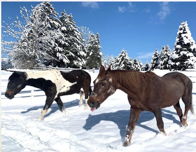
Toy and Apache, BFFs free to stroll through Tamerlaine's winter wonderland together.

Today, we don't know where Toy's babies ended up, or if she has outlived them already—and neither does she. But we do know that we changed the world—for Toy and Apache. With your help, we can make the future a kinder, gentler place for other horses like them, and give these majestic animals the respect and love they deserve.